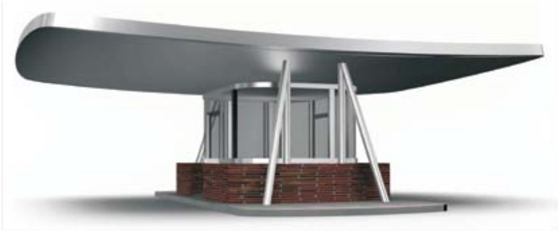
entrance control with shelter ▲

sailor's control point developed for Punat Marina: stainless steel construction, facade from laminate in wood pattern, tent, stainless steel fence, stairway, ▼