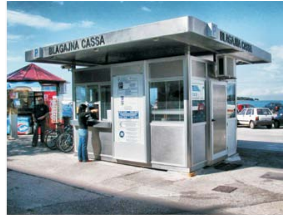
▼ pay tolls - sale points 3,0 x 3,0 m stainless steel construction, advertising window City Light, rolo closing Maksimir stadion, Zagreb

▶ stainless steel construction with several payment positions, dimension 4,0 x 3,0 m, stainless steel shelter with illuminated sign, integrated illuminated informative spaces City Light, air condition and venetians curtains