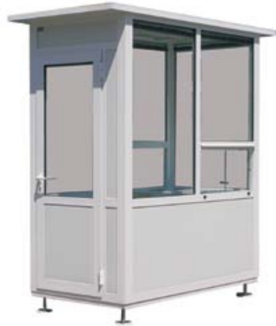
▲ 1,2 x 2,2 m aluminium construction

Pay tolls or entrance control objects, sale points etc. are made in several standard types depending on dimensions, material or equipment.