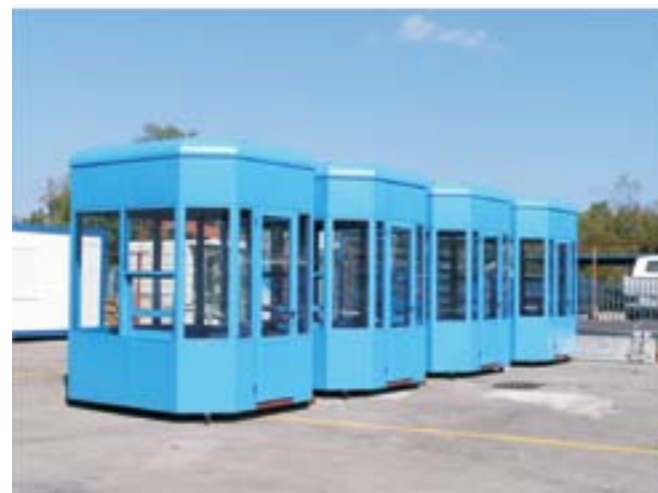
▼ border control aluminium construction 3,0 x 2,4 m