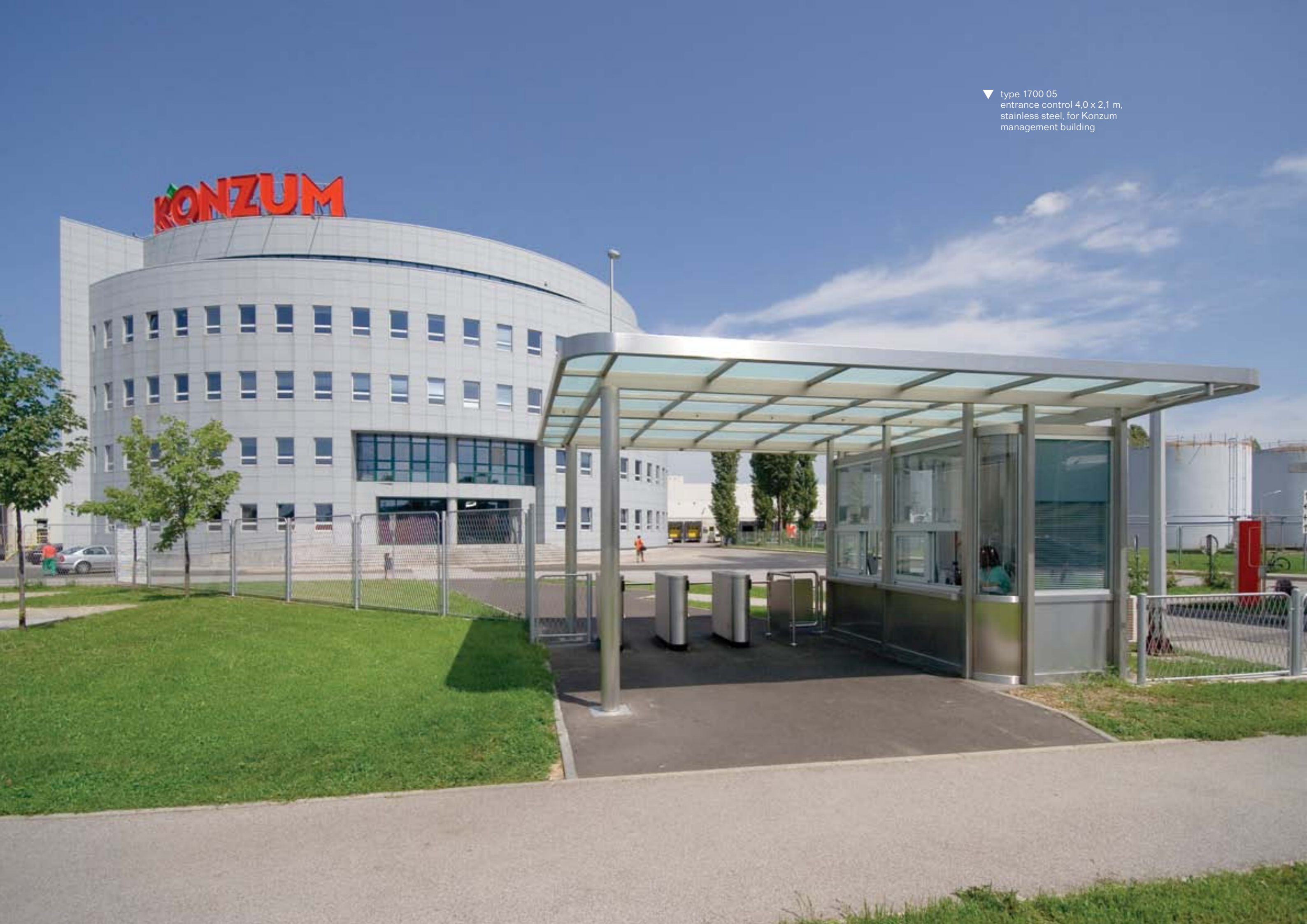
▼ type 1700 05 entrance control 4,0 x 2,1 m, stainless steel, for Konzum management building