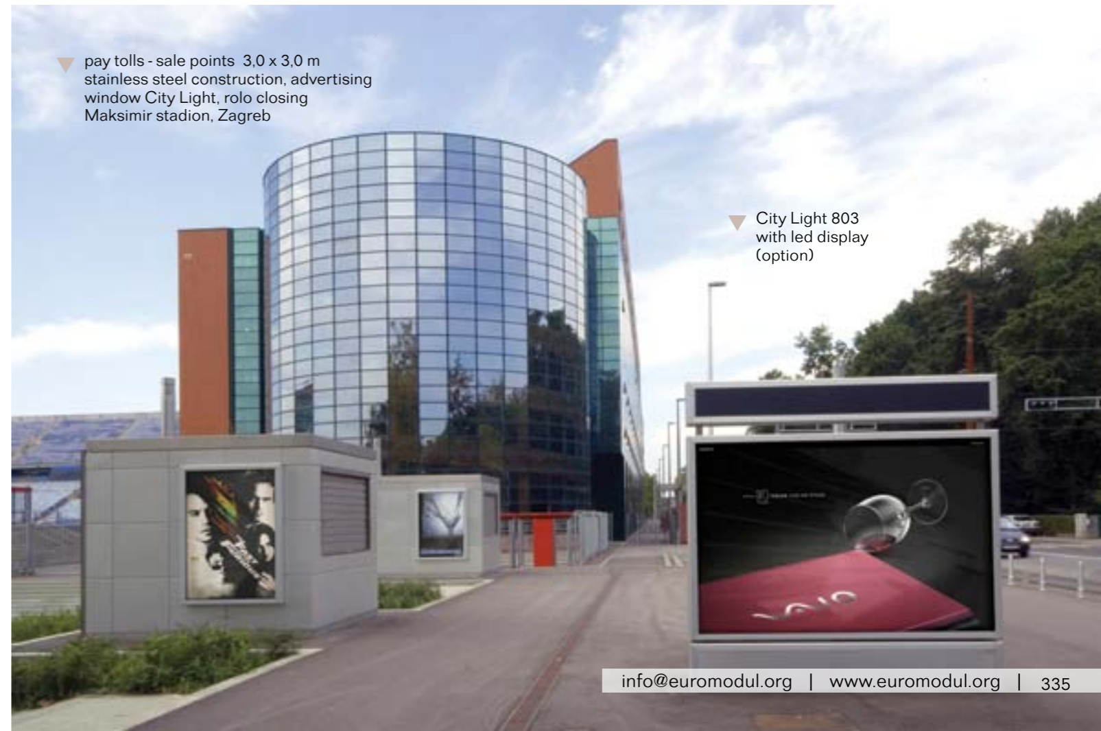
▼ City Light 803 with led display (option)