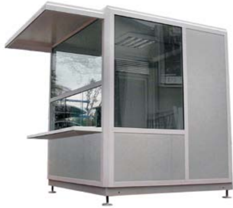
▲ 2,4 x 2,4 m with shelter and desk, aluminium construction