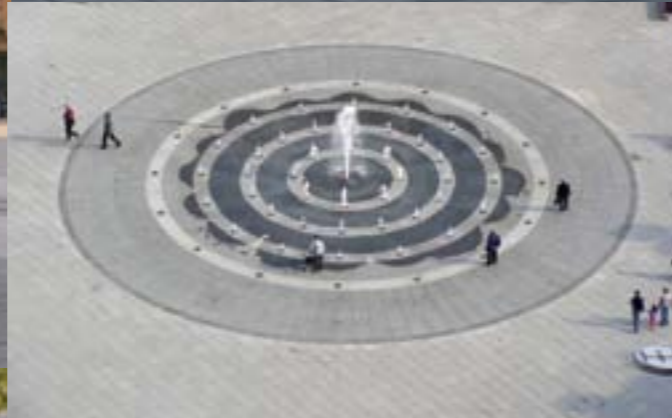
City of Osijek square with three entrances in underground shopping center, benches, litter bins, light pollars, fountain, city light advertising vitrines, multipurpose units, etc...