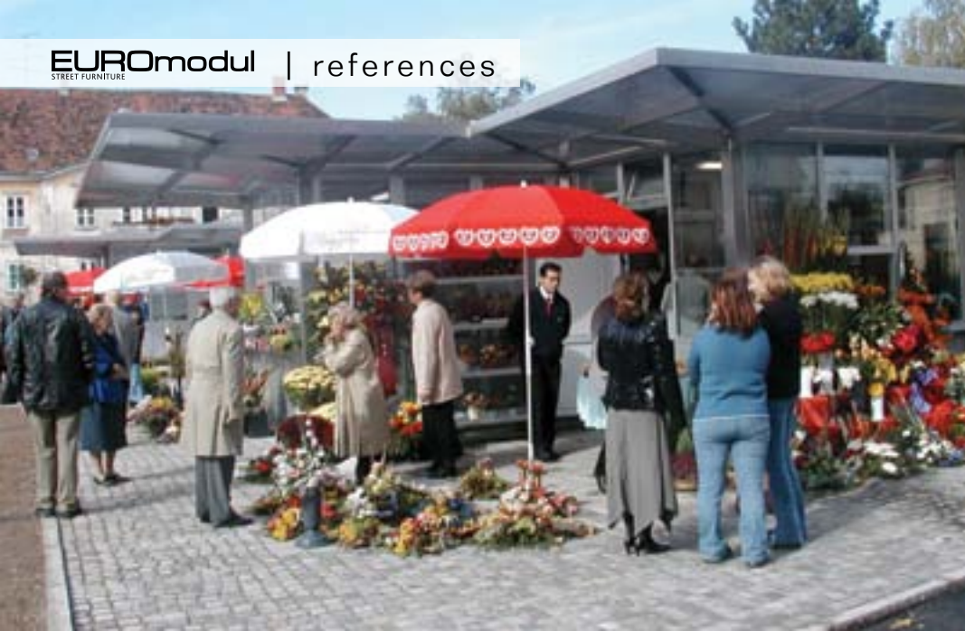
◀ stainless steel kiosk complex ,flower market'