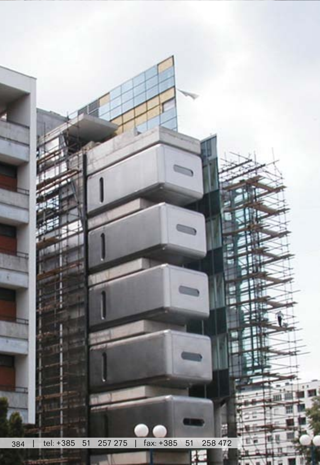
▼ prefabricated sanitary modules in new building of Croatia Insurance company in Zagreb